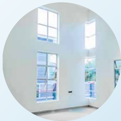
High Ceiling Level