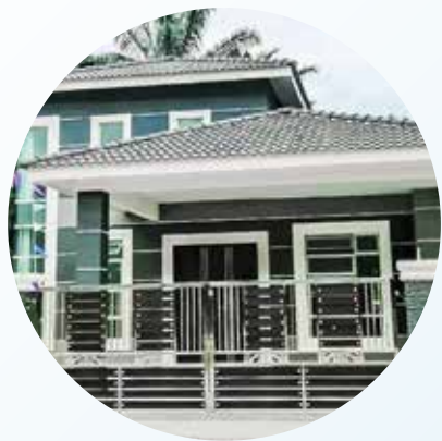
Modern Gate Design