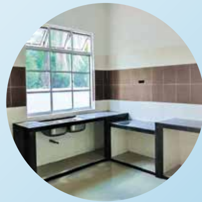
Free Table Top